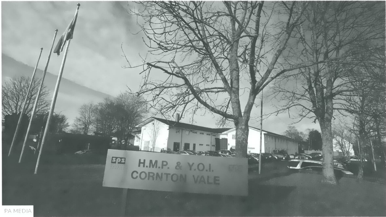
Cornton Vale women's prison is due to close soon, to be replaced by a new jail - HMP Stirling

"Finally, our ongoing policy review will be independently assessed by experts in women affected by trauma and violence."